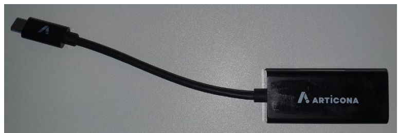
Sample of Ethernet to USB-C adapter