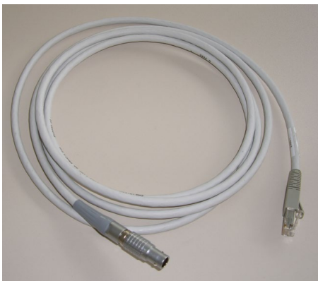
Leica GEV228 Ethernet cable